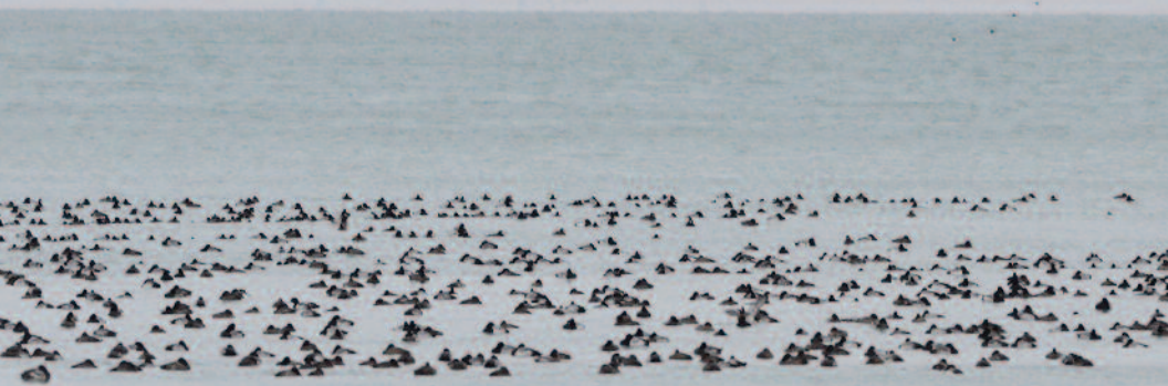
Figure 5. The number of staging and overwintering scaup (shown here) and other species of mussel-eating ducks has increased dramatically to hundreds of thousands of birds on Lake Erie since the invasion by non-native invasive Zebra Mussels and Quagga Mussels.

It is sobering to consider “what could have been” if the high levels of selenium that these birds ingest when eating the mussels were to seriously negatively affect their reproduction and survival.