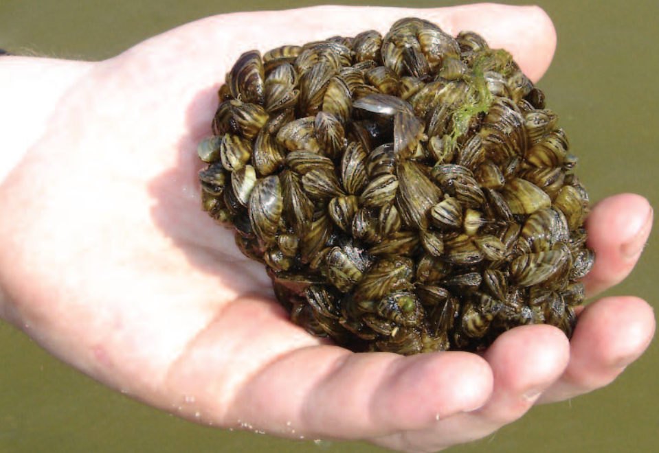
Figure 1. The non-native invasive Zebra Mussel (shown here) often has a distinctive zig-zag pattern on its shell, which is flattened on one side. By contrast, the non-native invasive Quagga Mussel (not shown) typically lacks the zig-zag pattern and has an all-rounded shell.

Over the past few decades, Lake Erie has been described as an environmental disaster, as well as a great conservation success. The health of the lake reached a low point in the 1960s and 1970s, but improved greatly by the 1980s (Makarowicz and Bertram 1991). Now, by contrast, we are hearing about harmful algal blooms, botulism, invasive species, climate change and other issues threatening Lake Erie water quality. The health of the