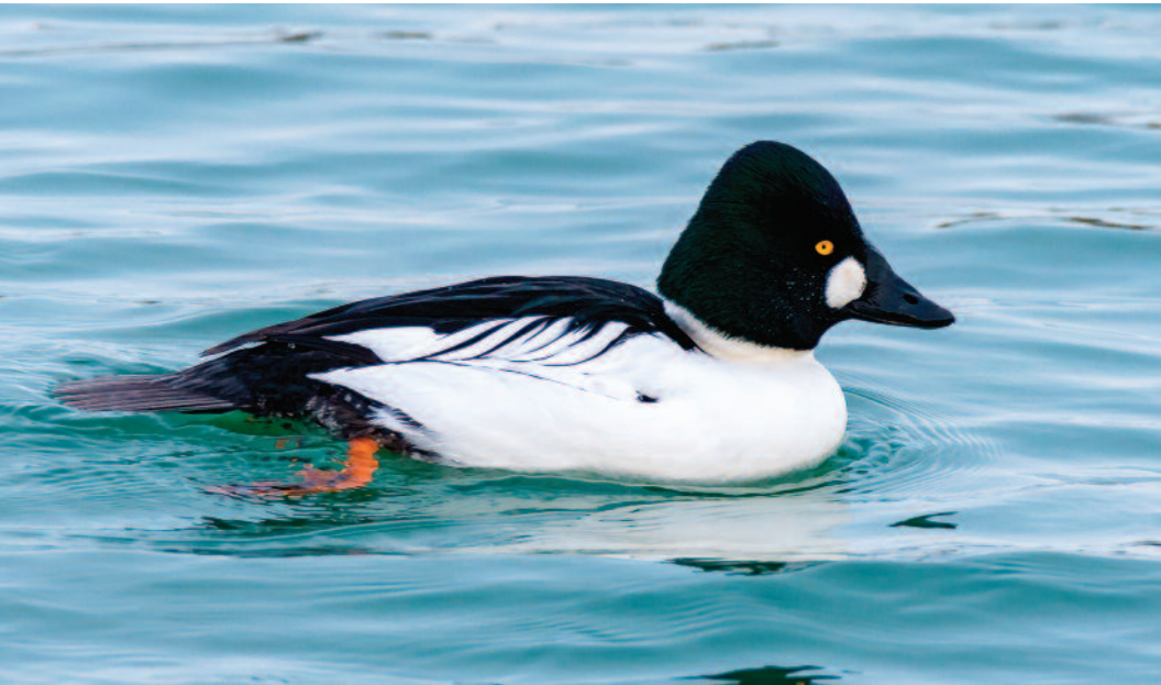
Figure 2. The Common Goldeneye is just one of several species of waterfowl that may have benefited from eating non-native Zebra Mussels and Quagga Mussels since they invaded Lake Erie and the rest of the Great Lakes. The mussels also indirectly benefit these ducks because various invertebrates that the birds are fond of eating are found at higher population levels amongst the mussels' shells. On the negative side, the mussels are a source of contaminants for the ducks, and sometimes a source of the lethal type-E botulism toxin.

around the mussel beds also benefit diving ducks, like Common Goldeneye (Figure 2), Long-tailed Duck, and especially Bufflehead, because they are particularly fond of eating the elevated numbers of shrimp-like crustaceans and midge fly larvae found amongst the mussel shells (Schummer et al. 2008a).